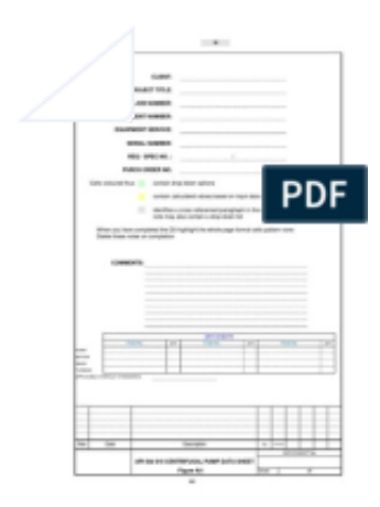
Api 610 11th Edition Pdf Free Download